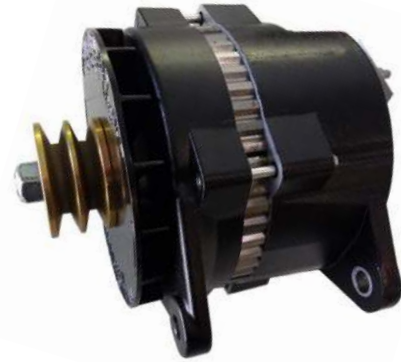
97EHD-Series 85A & 110A, 24V

Contact Balmar Tech Service to learn more about the 97EHD-Series Alternators!